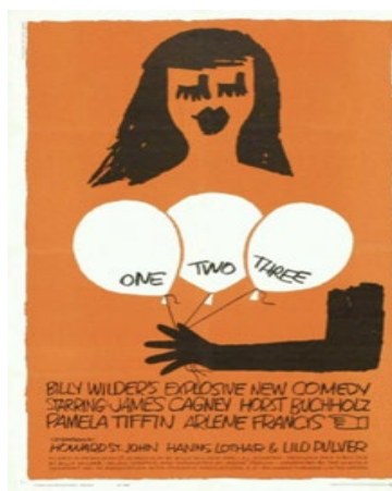
ONE, TWO, THREE April 17th