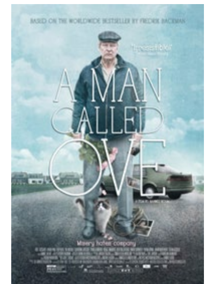
A MAN CALLED OVE November 20th