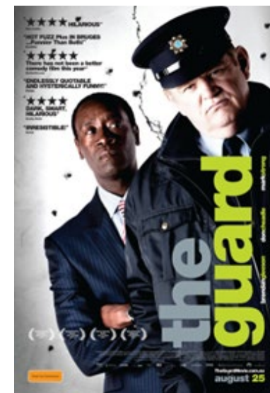
THE GUARD October 16th