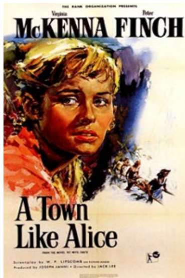
A TOWN LIKE ALICE July 17th