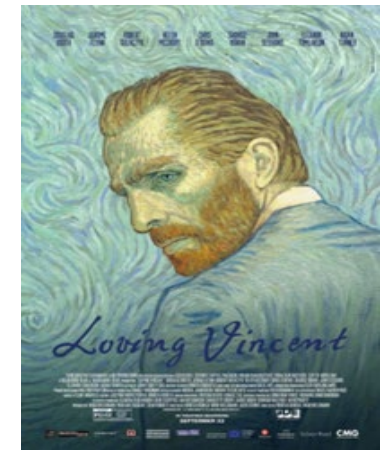
LOVING VINCENT June 19th