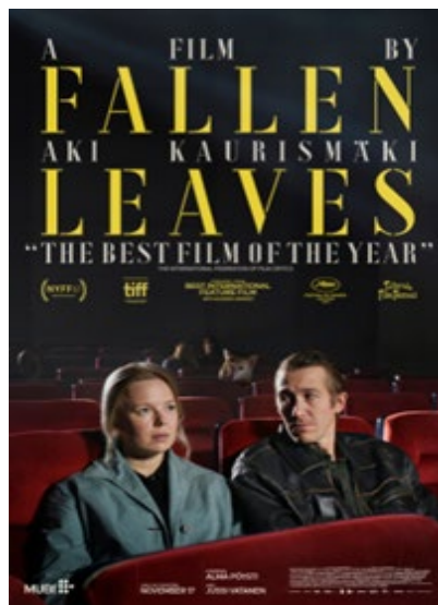
FALLEN LEAVES August 21st