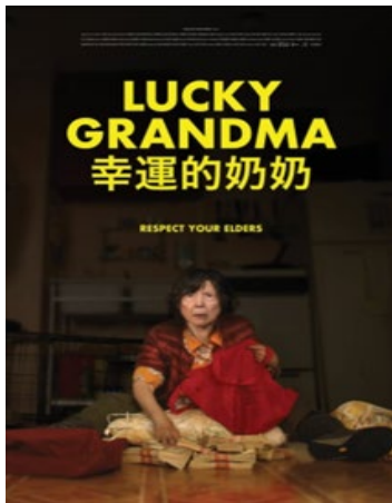
LUCKY GRANDMA February 20th

St Paul's Lutheran Church Hall | Doors Open 6:30 PM | Start 7:00 PM | Pre-Bookings Essential (See below for details)